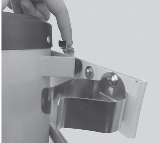
4. Turn the safety mechanism (on the dryer) clockwise to secure it to the mount.