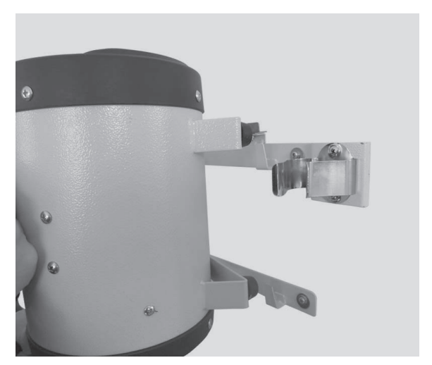
3. Line up and attach the dryer to the metal brackets.

2. Find the dryer hose bracket (A) and attach it to the large metal bracket (E). Secure with the small screws (B).