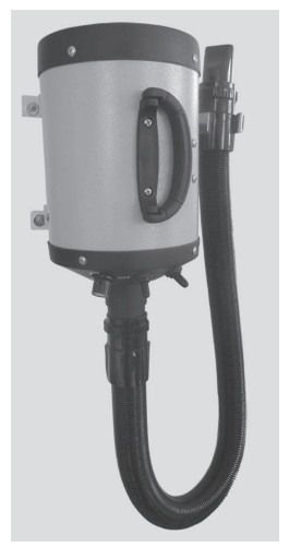
Dryer hose attachment easily fits into dryer hose bracket.