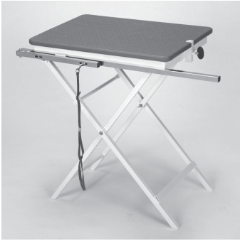
4. X-style frame will lock in place when completely upright.