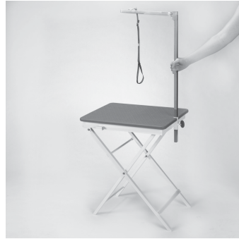
6. Place grooming arm in the slot on the edge of the table and tighten bolt clamp to secure to the tabletop.