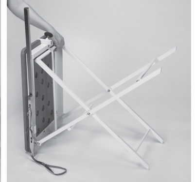
3. Hold the pull bar when rotating the table to an up upright position.