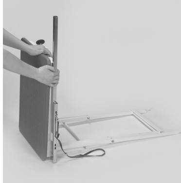
2. Lift the tabletop up to a 90° angle then slide the pull bar on the legs up to form the X-style frame.