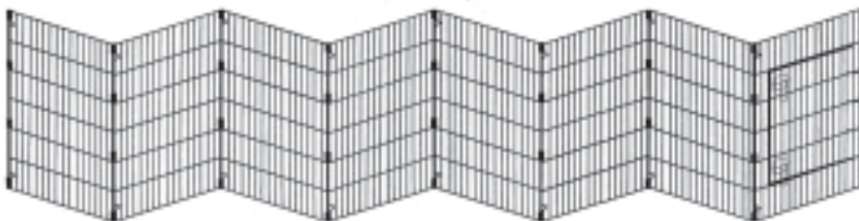
Fence (up to 16')